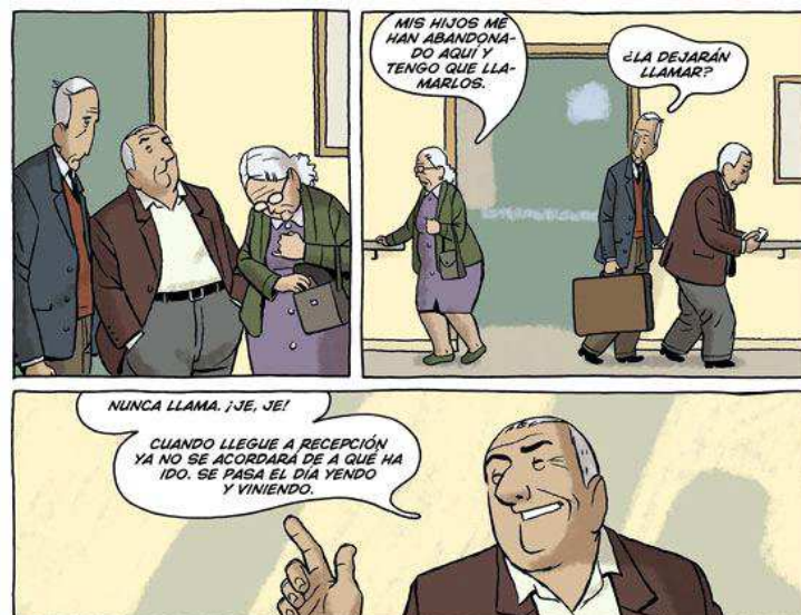
Fig. 2 Frames from Arrugas (2007)

Roca told me that a challenge in moving the story from the written and the drawn page to the screen, and in finding a register in the first place for the story, in any medium, was that of locating an existing frame of reference, or genre, within comics and animation from which to work. When he found it, this came from the neo-realist style of Spanish comics in the 1950s, and from outside the European filmmaking and comics tradition, in the form of anime and manga, and from their accommodation--more habitual than in European genres--of a visual language that embodies the routines and habits of everyday life. Roca mentioned Osamu Tezaku and Isao Takahata as particularly influential in his discovery of a visual language that would work for Arrugas . Interestingly, the French translation of Arrugas is introduced by the late Jiro Taniguchi.