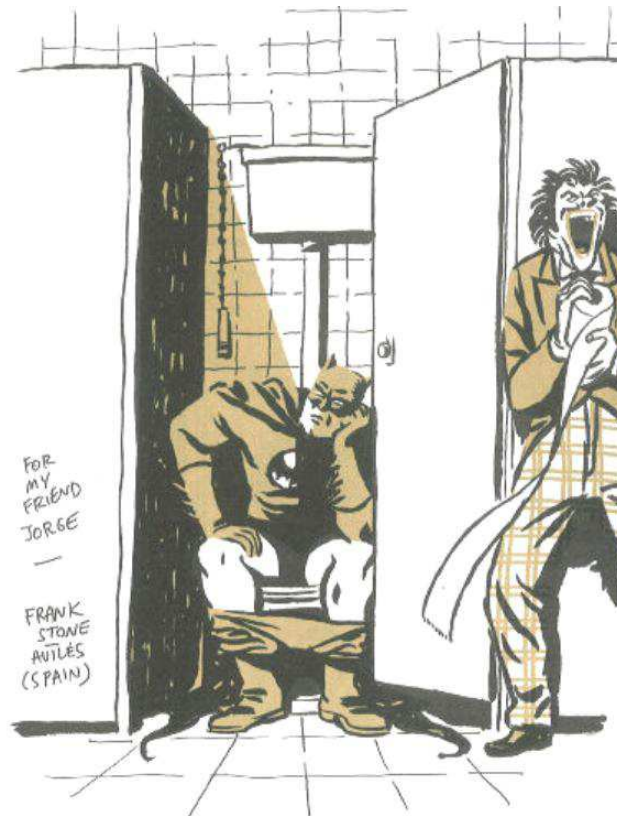
Fig. 1 'Draw me a Batman'

Frame from Emotional World Tour , by Paco Roca and Miguel Gallardo (2009)