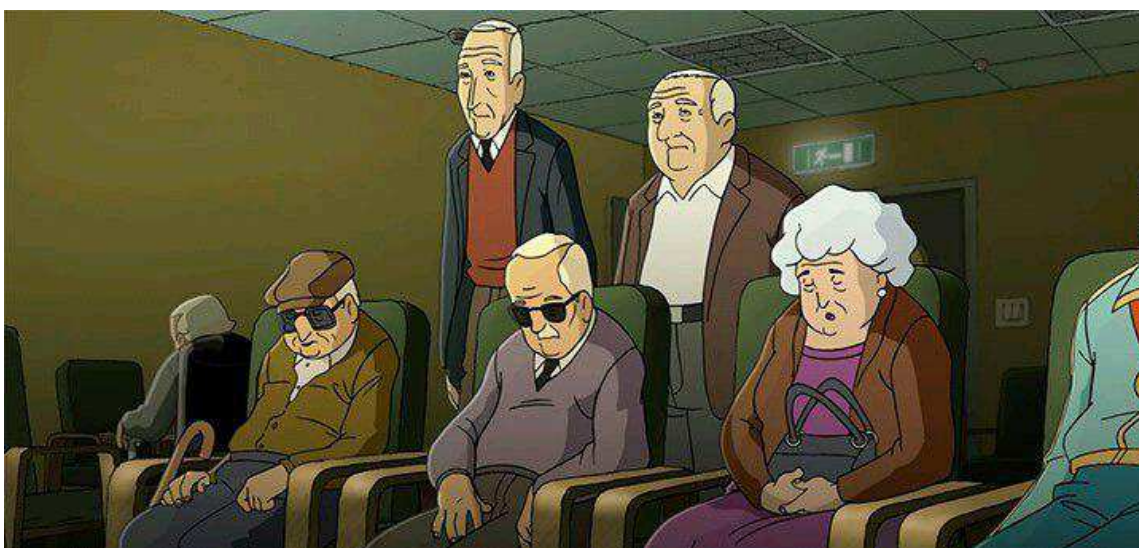
Fig. 3 Still from the film adaptation of Arrugas (2011), directed by Ignacio Ferreras

AM3 There's a lot of humour in the film and there's a fine line, isn't there, between laughing at old people's difficulties and laughing with them. Obviously the humour was a very important part of the book. How did you approach the humorous content, and how did you go about negotiating that fine line?