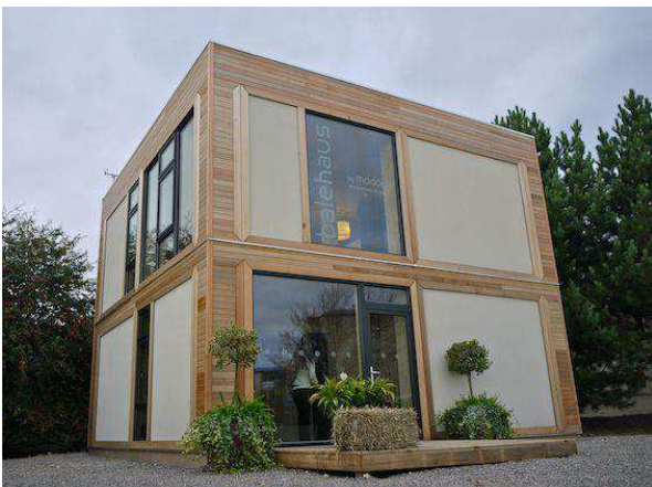
Figure 3 Modcell’s Balehaus@Bath 8

This company was deliberately system building, translating ‘deep green’ materials to the mainstream, but at the same time accommodating modern building practices of low-skill requirements, easy and quick construction and modern aesthetics, as well as consumer expectations about housing appearance. Thus niche practices can be translated to the mainstream, albeit incorporating significant modifications. Figures 2 and 3 illustrate the diversity of straw bale building styles which can arise from the same basic technology.