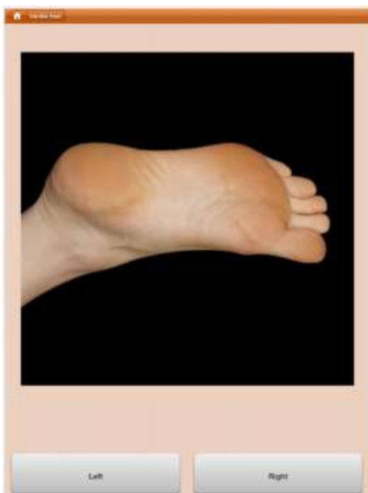
Fig.2, shows an example of the pictured foot using the Neuro-Orthopaedic Institute Recognise™ software. This could be either left or right and subjects entered their decision on a key touch pad.

The research protocol was approved by the Cardiff University School of Healthcare Studies Research Ethics Committee and the Ministry of Defence Research Ethics Committee, Whitehall, London, Protocol no. 422/MODREC/13. The research was conducted in accordance with the Declaration of the World Medical Association and written informed consent was obtained from all participants.