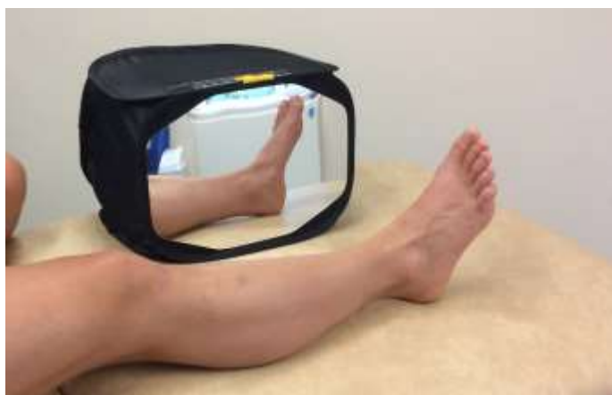
Fig. 1, shows the setup of the mirror box that was used to create the illusion of an intact and complete image of the missing limb. This is achieved by reflecting the unaffected limb.

The intervention consisted of one 10-minute session of MT with a mirror box (Reflex Pain Management Ltd, Cheshire, UK, Patent Pending), used to create an intact and complete image of the missing limb by reflecting the unaffected limb(Fig 1). The mirror was positioned perpendicular to the patient's midline and sock/shoes were removed. Participants were asked to move the unaffected limb while imagining and attempting to execute the movement with the amputated limb to match those seen in the mirror. The participant was asked to undertake movements for 10-minutes (e.g. flexion-extension cycles, rotation of the relevant body part and wiggling of toes) at their discretion,[9]and was in addition to conventional treatments. No attempt was made to control medication or record psychological therapy input.