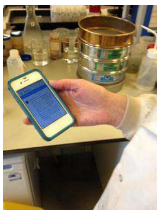
Figure 2. Participant showing phone application used for the research group to share messages of activities, progress etc. while working in the lab.

Additionally, new modes of workplace governance were also revealed. This was through the use of virtual chat spaces, such as Facebook groups, or specific mobile applications. These were discussed during interviews with some participants and observed in use during the observation days. For one lab group, a mobile application allowed the group to keep track of what other users were doing during the day (see Figure 2). This was favoured as opposed to using email as it offered a real-time way to keep in touch, collectively, ‘on the go’ in the lab.