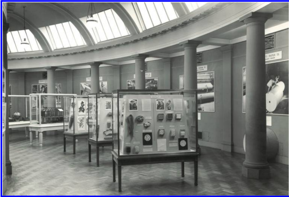
Figure 6. “Paper and its Uses” exhibition at National Museum Wales, Cardiff, 1958.

educational activities. One aim is to increase the number of native Welsh specimens, and, in the longer-term, there are plans to produce digital images of the specimens, accessible online.