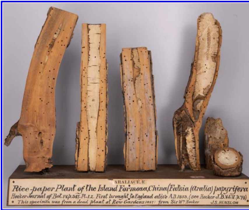
Figure 3. Specimens of Aralia papyrifera Hook. sent to J. S. Henslow by William Hooker in 1855 and now in the Cambridge University Herbarium and Cory Library.

two rooms were re-arranged according to monocotyledons and dicotyledons, as at Kew. Other elements of display were also redolent of Kew and with good reason: many of the framed botanical wall charts at Cambridge, for example, were donated by the Kew Museum (Gardiner 1904: 13). As Gardiner (1904: 17) said of wall charts, “they do much to decorate and enliven the whole collection, which might otherwise stand in some danger of being deadened and overweighted by the presence of many dried specimens.” In 1888, teaching demonstrations also began to take place in the Museum, further marking it as a space of pedagogy.