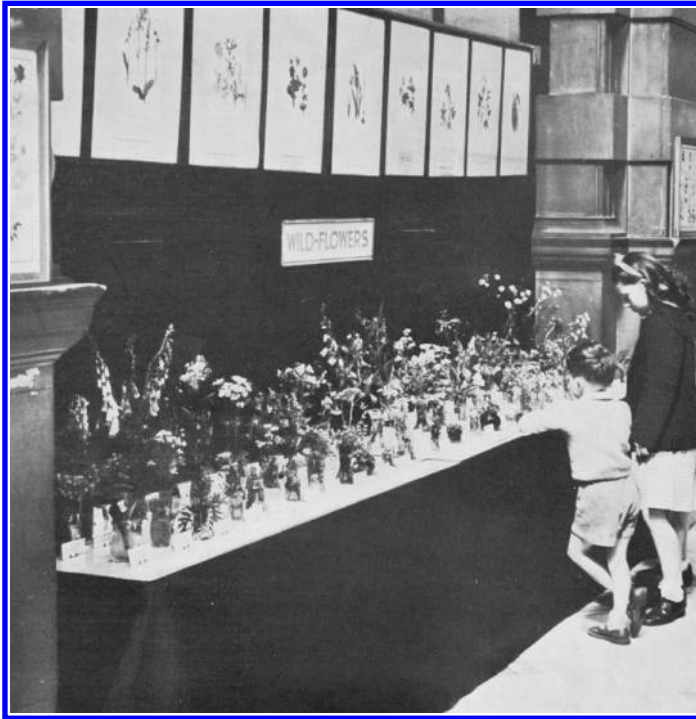
Figure 1. Annual display of local wild plants in Kelvingrove Museum, Glasgow, 1949.

Jones in 1976, 11 plants were represented solely in the summer display of wild flowers (Figure 1). 12 This annual exhibition was introduced by William Rennie, an amateur enthusiast, and subsequently maintained by members of the Andersonian Natural History Society. 13 “Habitat cases” were introduced in the 1980s in which models were used to represent plants; and in the 1990s the “Green Area” was an initiative at Kelvingrove to create interactive displays on environmental conservation. Living plants have featured strongly in various displays concerning, for example, the growth of trees, and plants used as dyes. 14 In the World Cultures collection, existing and more recently-acquired ethnobotanical specimens have been included in the “Charms and Healing”, “Ancient Tea Horse Road” and “Life in the Rainforest” displays at Kelvingrove. Indeed, it is in these displays that Natural History and World Cultures once again come together. There are also botanical specimens in Kelvingrove’s Environment Discovery Centre and the “Wild about Glasgow” displays which feature sections on taxonomic groups, food chains and seed dispersal. 15