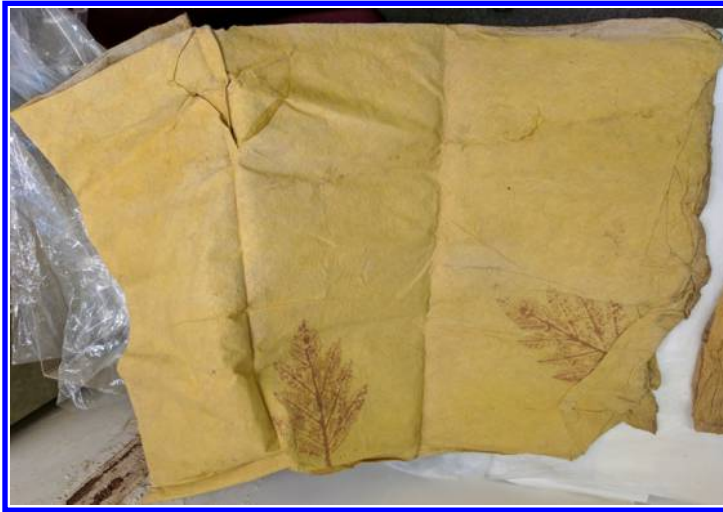
Figure 5. Barkcloth tiputa from Tahiti, collected by Prince Alfred in 1869 and now at Warrington Museum.