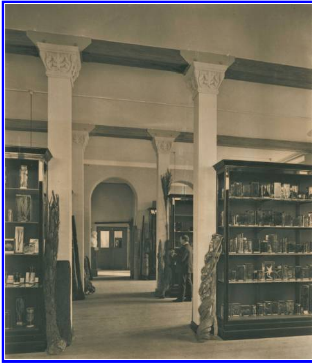
Figure 2. Cambridge Botanical Museum, 1904.

Downing site. The Botanical Museum, today used as the first-year teaching lab (Figure 2) was situated on the ground floor in a large, purpose-designed room.