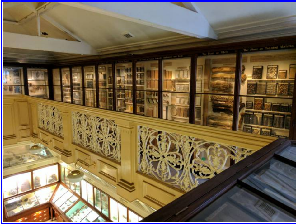
Figure 4. Botany Gallery, Warrington Museum.

the museum” (Madeley 1914). Madeley expanded the botanical collections in Warrington, transforming a reference collection into the basis of an educational museum display; central to this concept was the expansion of the economic botany collections.