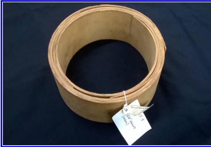
Figure 7. Sieve hoops of elm wood received from Kew in 1924.

aids and texts too. In 1924, Thomas’s successor, Harold Augustus Hyde (1892–1973), received a collection of manufactured articles from home grown timber, thought to be from the 1924 British Empire Exhibition at Wembley and now in the wood collection at NMW (Figure 7). In total, Amgueddfa Cymru – National Museum Wales still has 93 of the 112 economic botany specimens donated by Kew in the 1920s.