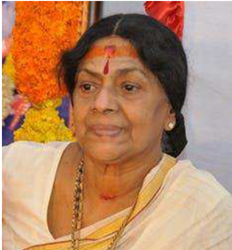
Bollywood actress Sukumari.

The top spots are occupied by actors from Indian cinema – with the great Bollywood actress Sukumari winning the competition, having made 703 credited movie appearances. The next actors are then [ Jagathy Sreekumar ], Adoor Bhasi , Brahmanandam , Manorama , Sankaradi and Prem Nazir , who each appear in more than 500 movies. The only non-Bollywood actor breaking the top 20 is Oliver Hardy, who has 373 films to his name. Then, if you were to look for any of this year’s acting Oscar winners, you would have to go all the way down to the bottom to find Brad Pitt, who has made a total of 56 movie appearances.