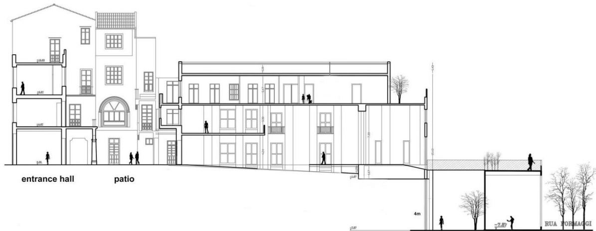
Fig.5. Longitudinal Section across the theatre of Santa Chiara. Peiru Chen, EMUVE Design Research Unit-WSA.

attracting to the Centre other kinds of users that will engage with current ones, thus offering multiple opportunities for the intercultural social production of these new spaces.