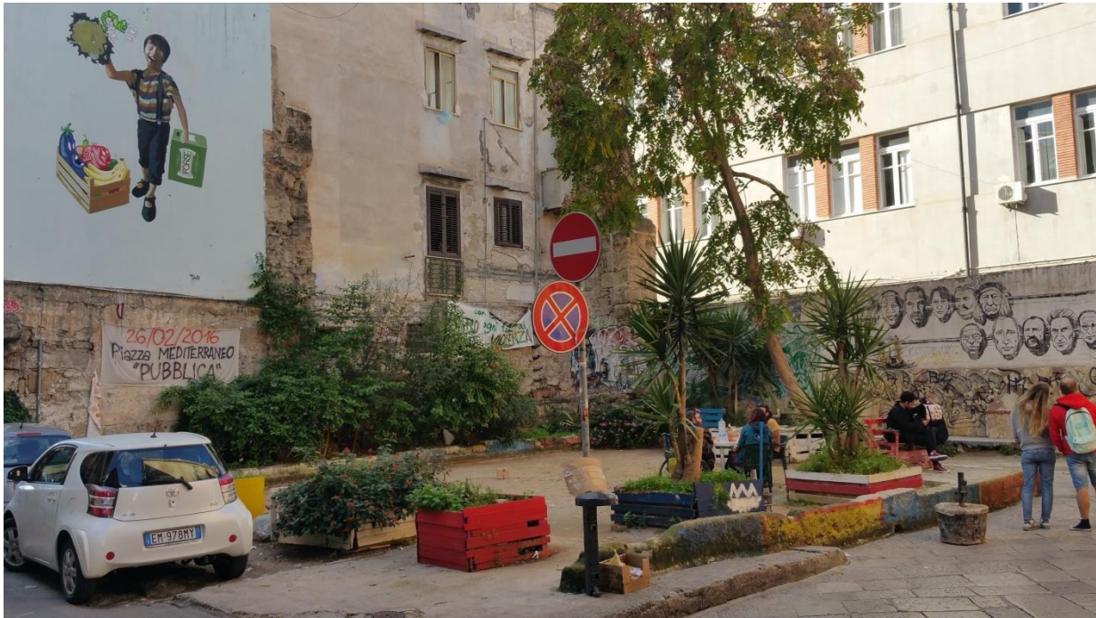
Fig 1. Piazza Mediterraneo (OBG, 2018)

and called it Piazza Mediterraneo, reflecting on the multicultural character of the neighbourhood.