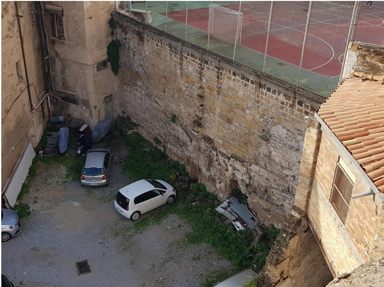
Fig. 4. external Phoenician wall with its associated urban space, currently fenced off.

At the rear of the complex, an urban void owned by the Centre and currently fenced off and invaded by garbage and rubble will be transformed into a semi-public space opened during the day and maintained by the City Council 38 . Furthermore, this potential semi-public space includes in its background another vertical stretch of the aforementioned 7 th B.C. Phoenician wall, that will be a unique attractor both for visitors and neighbours (Fig.4). This urban intervention will offer the possibility of a direct articulation of the Centre with the urban structures of Piazzetta Ecce Uomo and Via Casa Professa, as shown in Fig.3. This will increase the permeability of the complex by allowing the opening of a second entrance, providing a new circulation between the rear and the front, running across the theatre space and enabling the visit of the inner Phoenician archaeological survey (Fig.5). This new circulation will be activated by a series of intercultural activities overlaying to the pre-existing ones, with the aim of