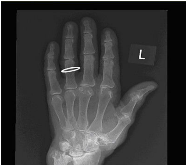
Figure 1 Plain x-ray appearance of the degenerative changes in the first carpometacarpal joint.

the reported dimensions. Chiu and Aschermann (1993) reported an 'extensive review of the literature' to claim the first report of a ganglion presenting as a thenar mass. However they did not report a reproducible literature search strategy to substantiate their claim.