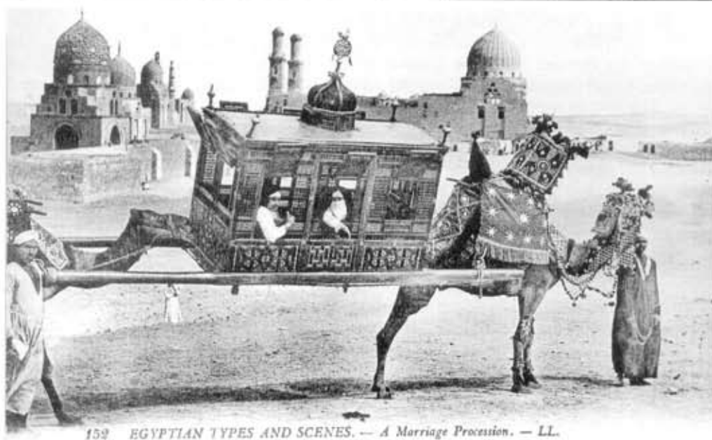
Plate 2. 152. Egyptian Types And Scenes.- A Marriage Procession. - LL (Louis Lévy).

The copyright date on this view is 1895; a year before the Underwood brothers made their trip to Egypt. Most other views in the set are dated 1896 or 1897. It should be noted that the set was amended over time, and some earlier views replaced by later ones, many bearing the copyright date 1904 3 . It is this later set which is the subject of Breasted's 1905 text.