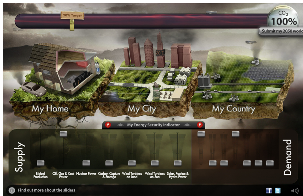
Fig. 2. The my2050 scenario tool illustrating the seven supply-side sliders. The tool is a simplified representation of the UK energy system. It enables exploration of different supply and demand-side options (including nuclear energy, fossil fuel generation, renewables, demand reduction, low carbon transport and heating systems, lifestyle changes) in order to reduce the UK’s carbon emissions by 80% compared to 1990. It was initially developed by the digital democracy company Delib for the UK Department of Energy and Climate Change and Sciencewise-ERC. A version of this tool can be found here: www.my2050.decc.gov.uk . (Contains public sector information licensed under the United Kingdom’s Open Government License v2.0).

Collecting multiple datasets using multiple methods was a deliberate design choice and it was important to include an analytic phase which explicitly brought the different research strands together to understand their combined insight. The qualitative and quantitative elements offered different qualities that were important to the synthesis analysis. For example, the survey was able to provide a certain weight to particular findings due to its large nationally representative sample (e.g. the strong preference to reduce fossil fuels), whereas the flexibility of the