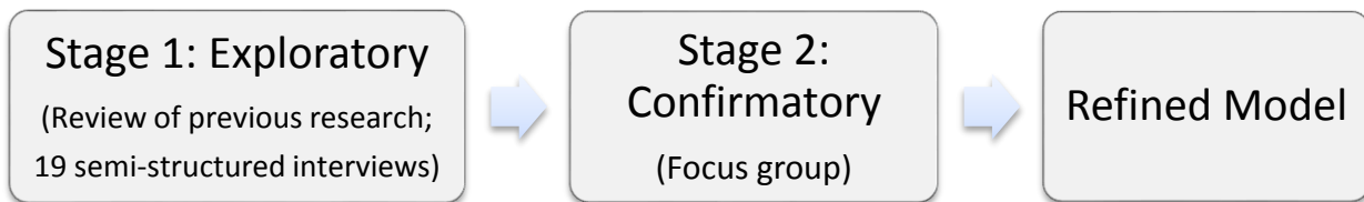
Figure 1. Methodological path of the research undertaken