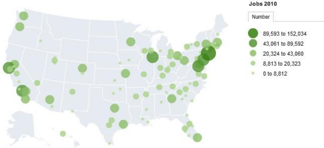
Figure 1. Aggregate Clean Economy by Metropolitan Area by Job Numbers.