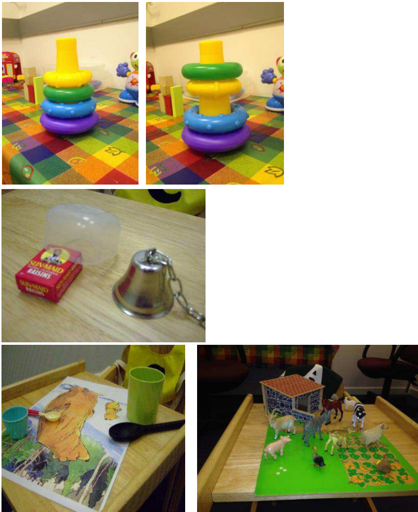
Figure 1. Equipment used in self-regulatory tasks during the early childhood laboratory visit (Tower of Cardiff, Raisin Task, Whispers Task and Big Bear Little Bear Task)