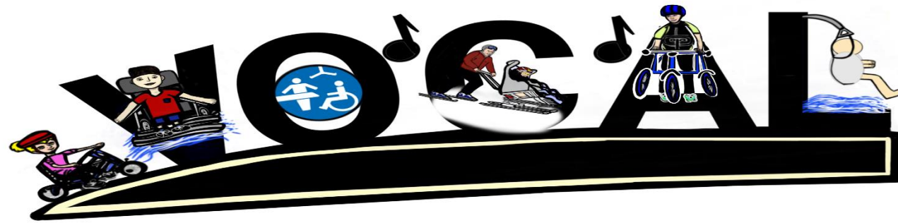
Poppy: Barrier to participation