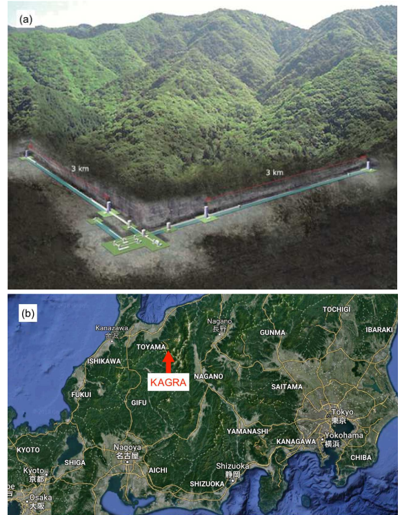
Figure 1: LOCATION OF KAGRA. (a) Concept image of KAGRA: a 3-km cryogenic interferometer inside Ikenoyama mountain. (b) KAGRA is located in Kamioka, Gifu, Japan, which is located 220 km northwest of Tokyo.

The latest event GW170817 [6], was the long-sought event of binary neutron star (NS) merger. The distance and location of GW170817 was narrowed down to 40 \pm 8 Mpc and about 30 \text{ deg}^2 in the sky by the LIGO-Virgo observation, allowing astronomers to identify electromagnetic counterparts and the host Galaxy (NGC 4993) [13]. Furthermore, afterglows from the merger remnants and later outcomes via various baryonic interactions were observed by the telescopes on the Earth as well as space satellites from radio to \gamma -rays.